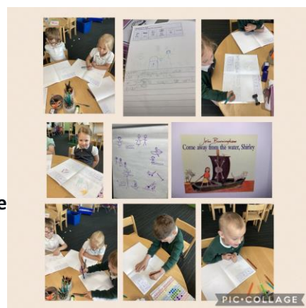
Reception children enjoyed listening to the story 'Come away from the water Shirley'. We wrote fantastic sentences about Shirley's adventure. #RRSArticle29